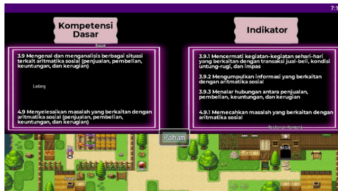
Figure 4. Basic competencies page view