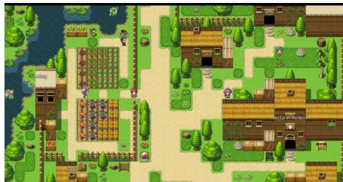
Figure 6. Play area view

After being developed, the media goes through the validation stage to determine the feasibility and quality of the media that has been developed. The validation stage involves two experts, namely media experts and material experts. The validation results can be seen in table 3 below: