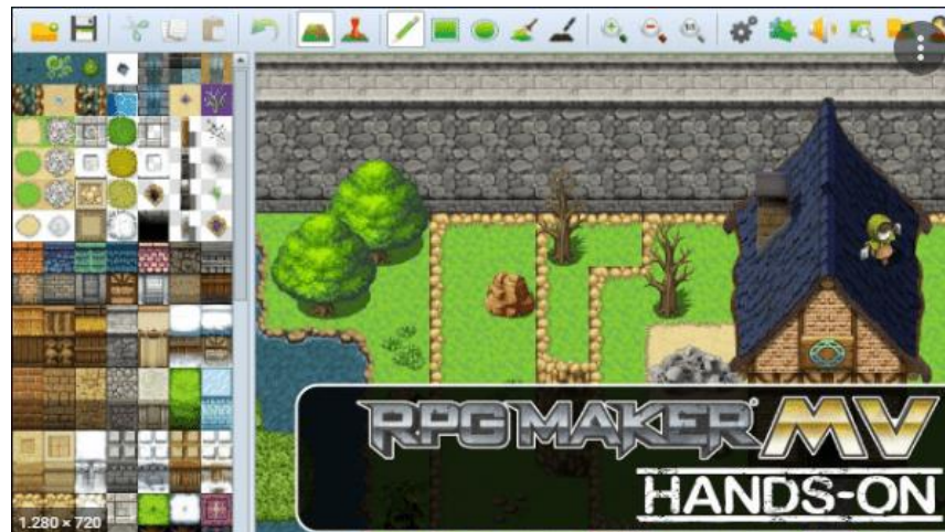
Figure 1. RPG Maker Game Display

Problem-solving skills are one of the abilities that a person must have, NCTM recommends that the mathematical ability that students must master is problem-solving ability (Buchori & Puspitasari, 2023). Problem-solving ability has two meanings, namely problem solving as a learning method and problem solving as a goal or ability to be achieved. According to (Sri Sumartini, 2016) (Bonotto, 2008; Umar & Ufi, 2022), there are five problem solving indicators, namely: (1) Identifying problems Solving data adequacy; (2) Build mathematical models and solve everyday problems; (3) Choose strategies applied to solve mathematical problems and/or problems outside mathematics itself; (4) Interpret and explain the results according to the original problem, and check the correctness of the answers; (5) apply mathematics meaningfully.