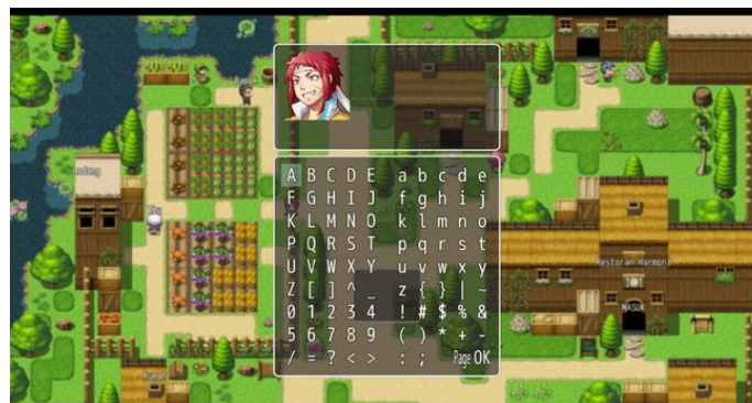
Figure 5. Player name input page view