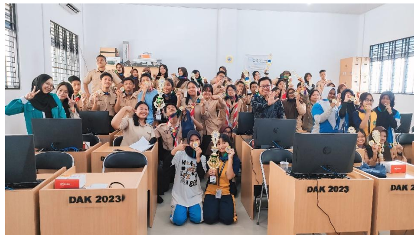
Figure 3. Documentation of Collaborative Project activities

only as a competition but also as a collective learning platform that encouraged students to express their understanding of digital literacy creatively.