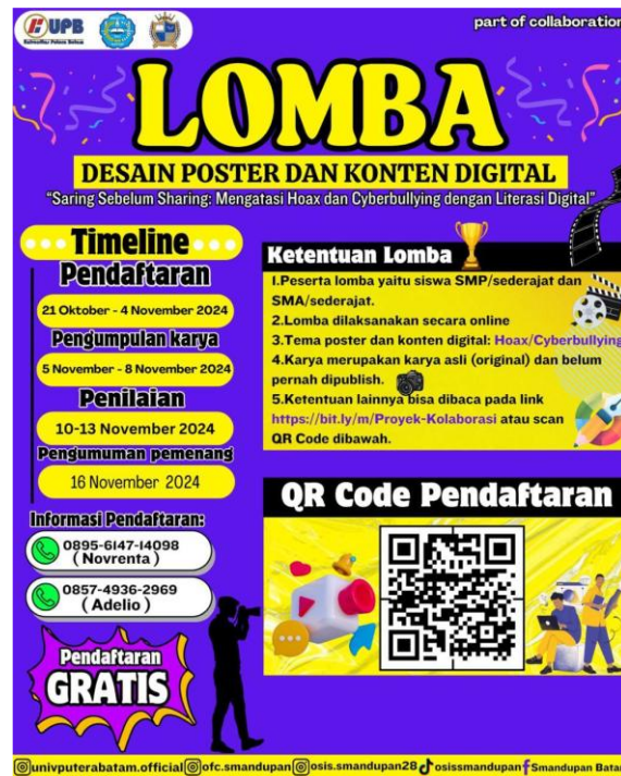
Figure 1. Poster Design and Digital Content Competition Poster

In addition to quantitative findings, qualitative data from student reflections also support these results. Many students reported that they became more aware of the impact of their online behavior. For example, one participant stated, “I realized that simple comments can hurt others, so I need to be more careful when using social media.” This indicates that the activity not only improved cognitive understanding but also influenced students’ attitudes and behavior.